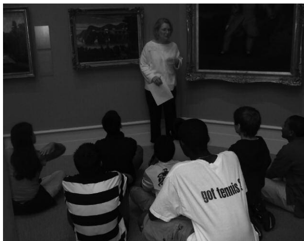
15-LOVE Excellence Participants listen to a lecture on the techniques of local artists at the Albany Institute of History and Art

With the 15-LOVE program, we went to the Art Institute in Albany. It was really big and nicely decorated. Once you walk in all you see is pictures of famous people and their life story. Once the tour lady came to attend us we walked up the stairs. We went in a room full of pictures. We sat down and she was talking to us about some paintings and how they were painted. She also asked us if we thought the people that painted the pictures went to school or not to be painters. After all that she started talking about what boats were being used in the old days. She told us what rivers they used and after that we did an activity. It was that we had to connect all the rivers together. I had a lot of fun.