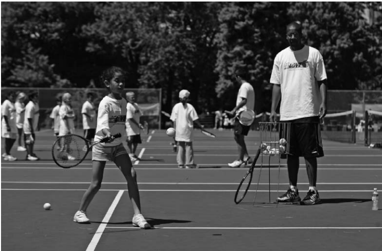
Participants and instructors at the 2007 summer Jamboree in Albany’s Washington Park

It’s a record! 1,821 participants this summer! To put this in perspective, just 5 years ago, the program had 1,600 participants year-round. Albany county still garners the largest attendance, but Schenectady and Troy have been building year after year.