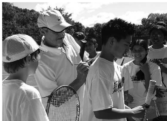
Roy Emerson signs autographs after the clinic at the Schuyler Meadows Club on August 18th.