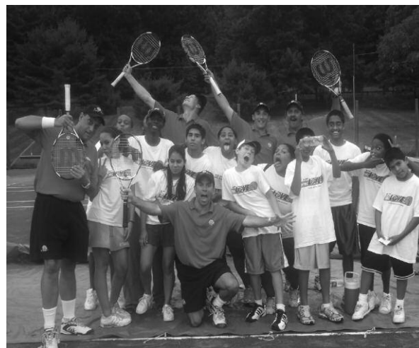
Members of PBI clown around with 15-LOVE Excellence Program Participants